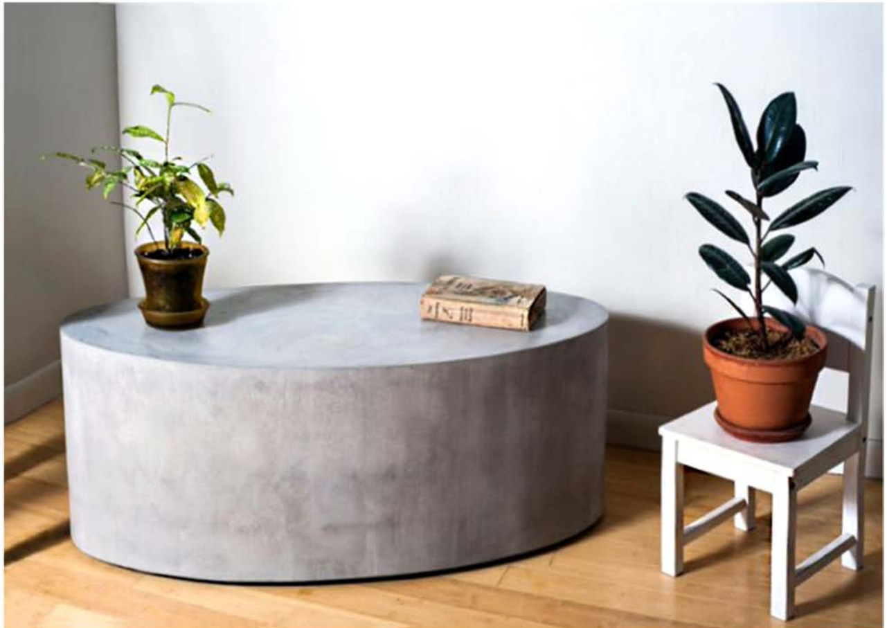
Shown here in Ash; 44" long, 20" wide, 16.5" high